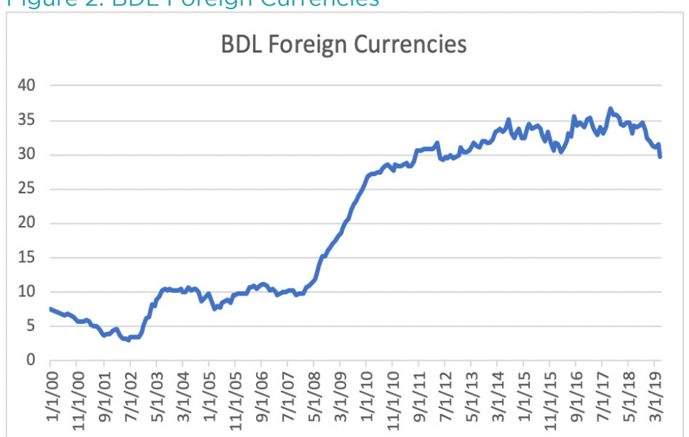
Figure 2: BDL Foreign Currencies<sup>2</sup>

Given this backdrop, BDL has had to directly fill this deficit in order to maintain the peg. Moreover, it has engaged in a series of unconventional monetary policies to artificially raise the interest rates in the economy in order to keep on attracting foreign currency deposits as investor confidence waned. These polices have drained liquidity from the market and diverted funding away from the government's deficit; as a result, BDL has also been continuously funding the government for the best part of two years, resulting in a transfer of the debt servicing cost from the government to BDL. Consequently, all these factors have led to a 16.61% YoY drop in BDL's foreign assets on 15/07/2019, or USD 7.37Bn, but little is known about its net reserves.